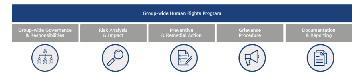
Graphic 1: The five building blocks of our Human Rights Program

Our human rights due diligence – for our own operations and supply chains – is based on five building blocks: