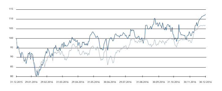
■ DAX ■ Fresenius share